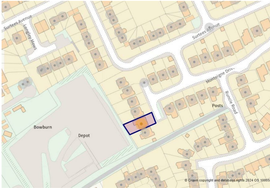
© Crown copyright and database rights 2024 OS 100059